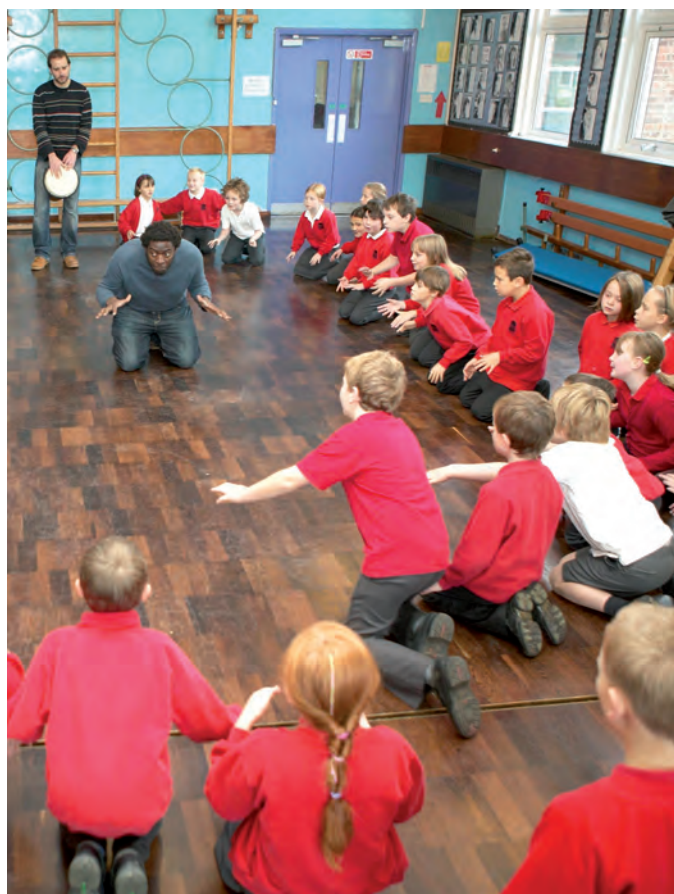
An African Music and Dance class that was performed at many lower, middle and upper schools in Central Bedfordshire. This picture was taken at Aspley Guise Lower School

staff road shows, as an example of the importance of council services working together: "The vibrancy and colour that greeted me when I dropped in on the concert was terrific. Communities in Central Bedfordshire had come together not only to celebrate their own cultures but also to give others some insight into their heritage. On the basis that ignorance is the enemy of cohesion, the events held during Black History Month provided residents with an opportunity to learn about people from different backgrounds in a way that was engaging and exciting".