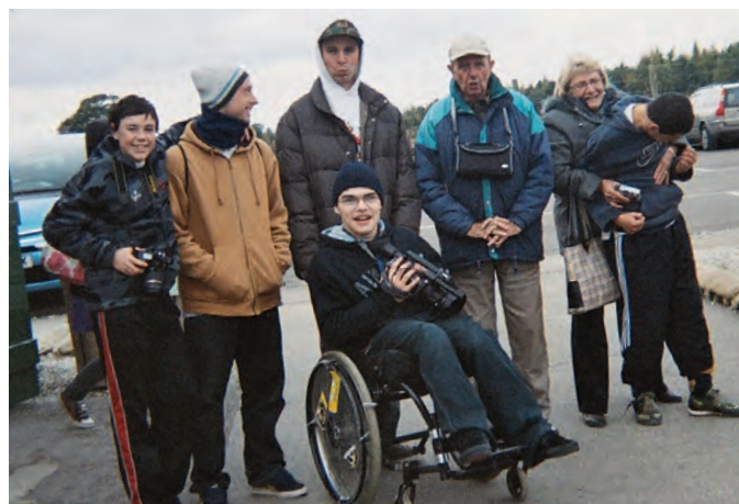
Above: Conflict and Change: Project participants on a trip to Eden Camp Second World War Museum, Malton.

Catterick Garrison, the largest British Army base in the world, recently saw the opening of a brand new library located in a purpose-built army leisure centre. For the 'Behind the Wire' project, garrison residents of all ages - from primary school children to veterans - looked at the effects on families of conflict past and present: a