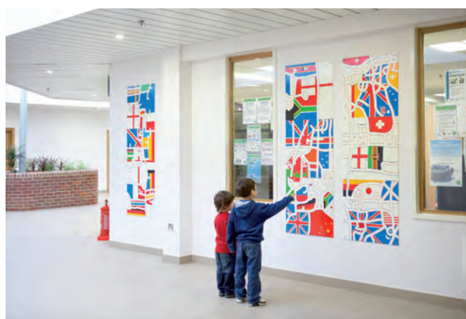
New artwork that depicts the cultural heritage of Central Bedfordshire has been installed at Houghton Regis Library