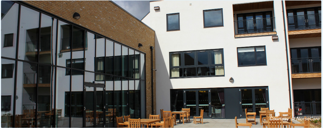
Part of Bowthorpe Care Village