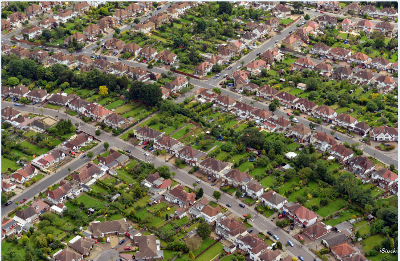
Housing in Surrey