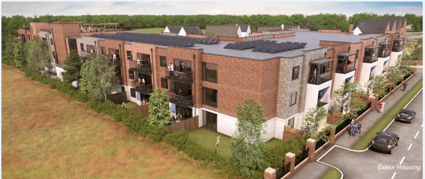
CGI of the Rocheway housing development