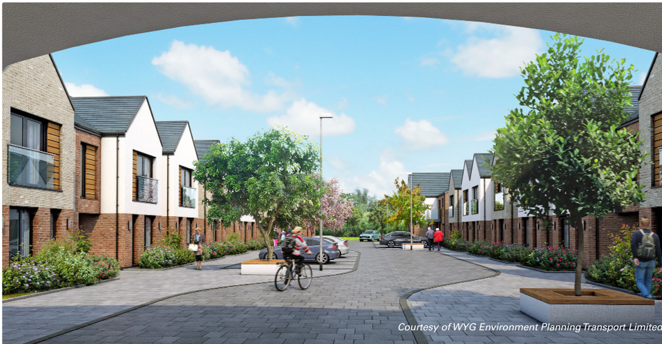
Proposed housing development at Baldock